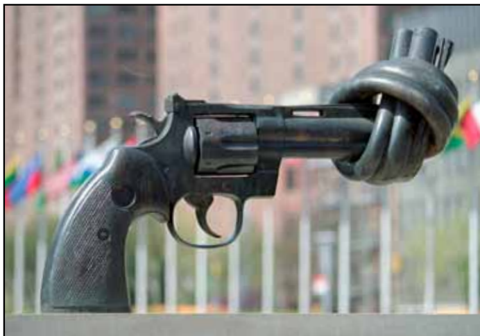
The Knotted Gun, gift of Luxembourg to the UN, 1988